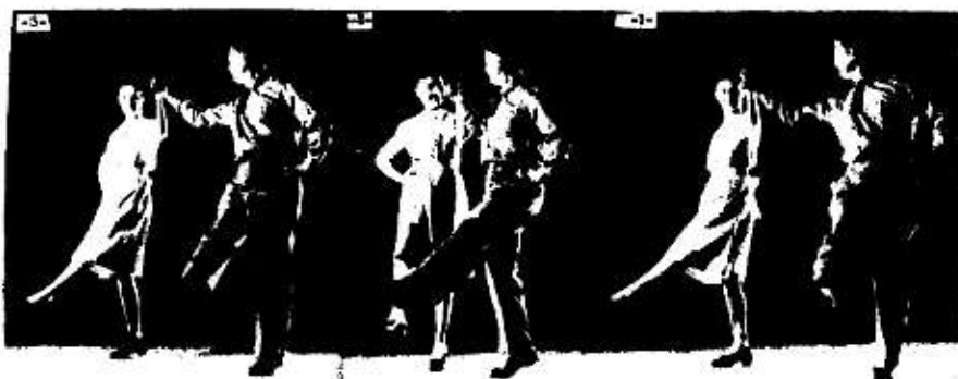
← Measure Three (Counts 1,2,3)

Dancers step on outside foot and swing inside leg forward and upward.