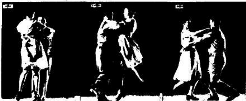
← Measure Four (Count 3)

Dancers step on outside foot and swing inside leg forward and upward.