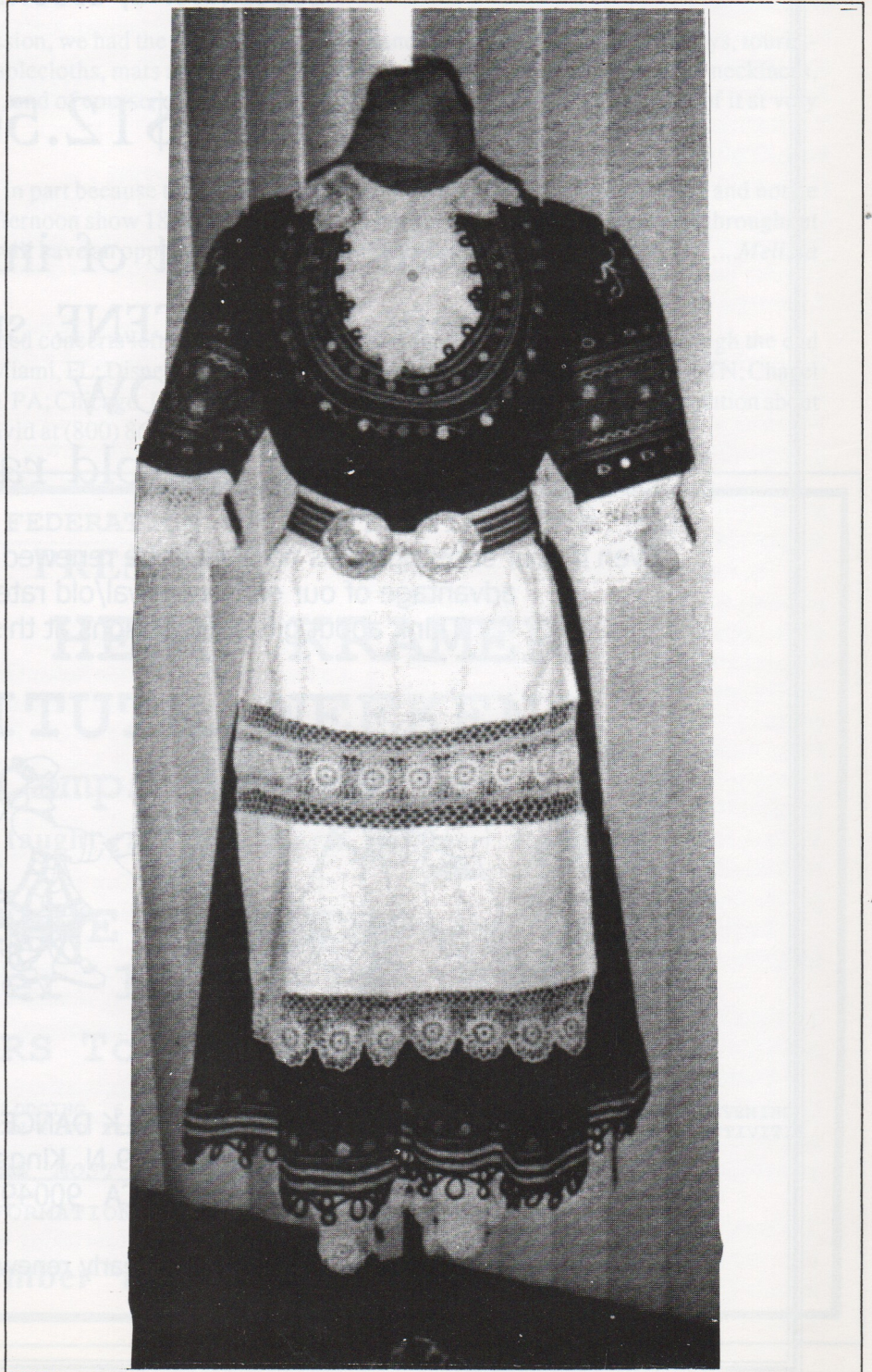
One of the Bulgarian costumes on display from the Sop region.