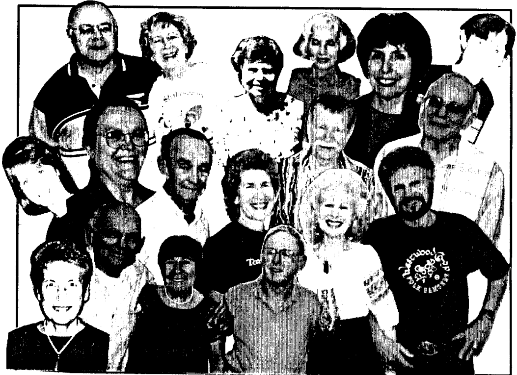
Westwood Cooperative Folk Dancers

Published by the Folk Dance Federation of California, South • Volume 35, No. 2 APRIL 1999