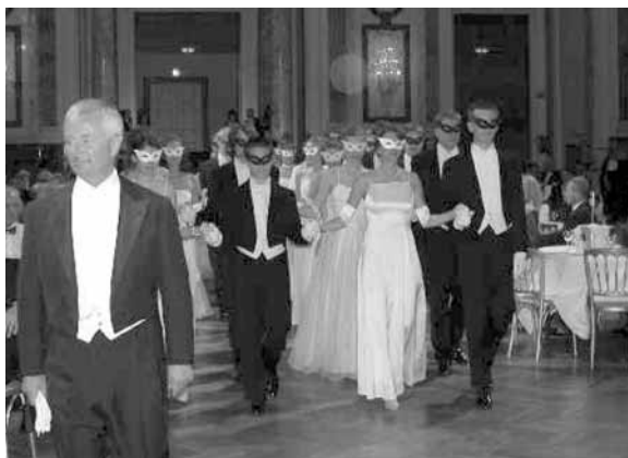
Polonaise at a Rotary International Ball in 2003.

The dances are perhaps most readily approached in order of tempo from slowest to quickest: Polonaise , Kujawiak , Mazur , Krakowiak , Oberek . Note that the polka is not one of them, though it is danced throughout the country.