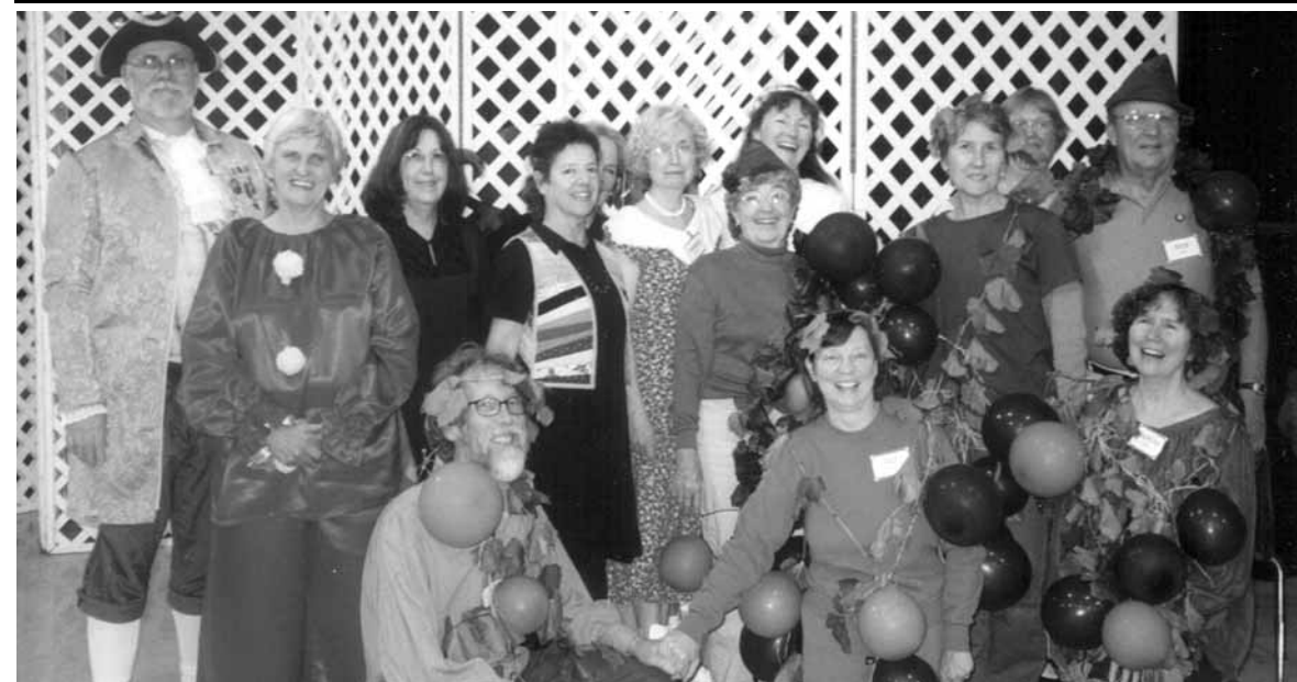
Dancers from Pasadena Coop and friends at the Camp Hess Kramer Camp's Review Anniversary Weekend