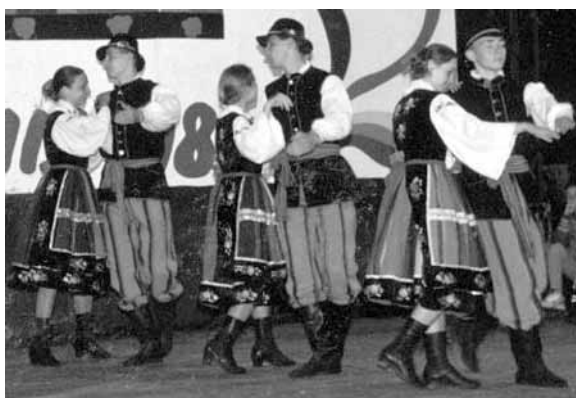
Kujawiak performed by Polish group Rok.