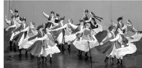
Mazur performed by Polish group Promni.

Its swampy soils were unable to produce abundant crops and its dance reflects the poverty in the sad, lovely strains of its music and in heavy, graceful gestures, a unique character of restrained beauty and free-flowing movement across the floor.