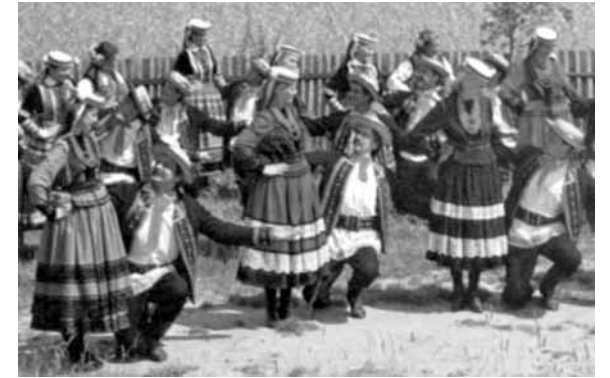
Oberek performed by Polish group Lubelszczyzny.

Krakowiak - Obviously from the Krakow region of south central Poland, near the foot of the mighty Tatras, the Krakowiak is the only national dance in 2/4 rhythm. The heel-beats are there, as is the rapid, lateral movement, but now comes a sudden stop, followed by vigorous figures performed in place, as though the horseman came upon the impassable mountains.