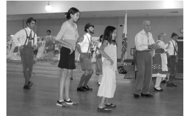
Young and old enjoyed the Macarena.

San Diego held its annual Oktoberfest September 22nd and 23rd at Balboa Park. The two-day event culminated in a dance festival Sunday. Entertainment was provided by Coast Kids Theater (pictured) and Balboa Park Performing Folk Dancers.