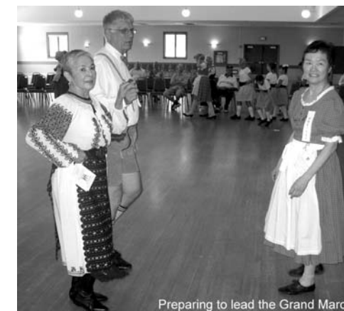
Preparing to lead the Grand March