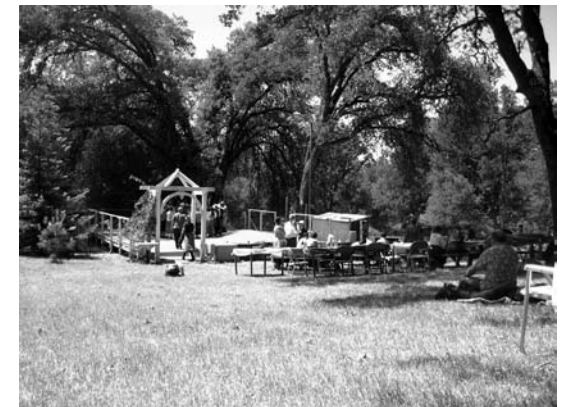
Dancing on the Wolterbeek's deck