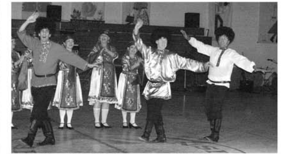
Syrtaki Folk Dance Ensemble