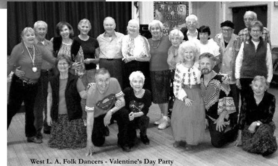
West L. A. Folk Dancers - Valentine's Day Party