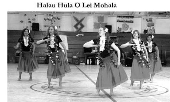
Halau Hula O Lei Mohala