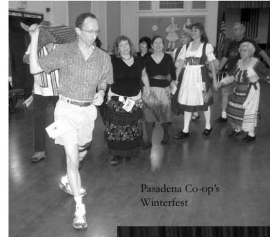
Pasadena Co-op's Winterfest