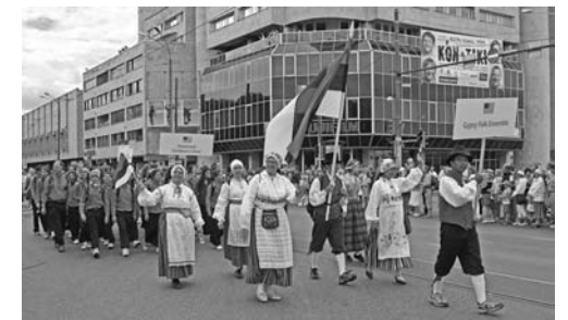
Members of Gypsy Folk Ensemble, honored guests for July 4th parade in Estonia