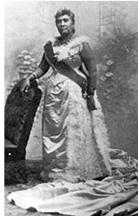
Queen Lili'uokalani October 2010