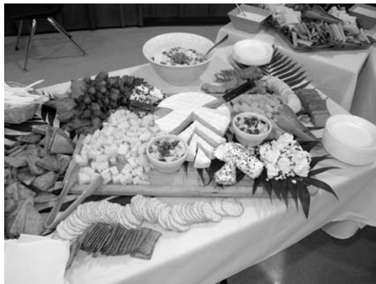
One of the food choices at Happy Hour