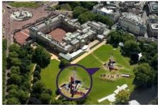
Frackingham specified in Buckingham Palace Press Association

Queen drills for gas in Buck House back garden