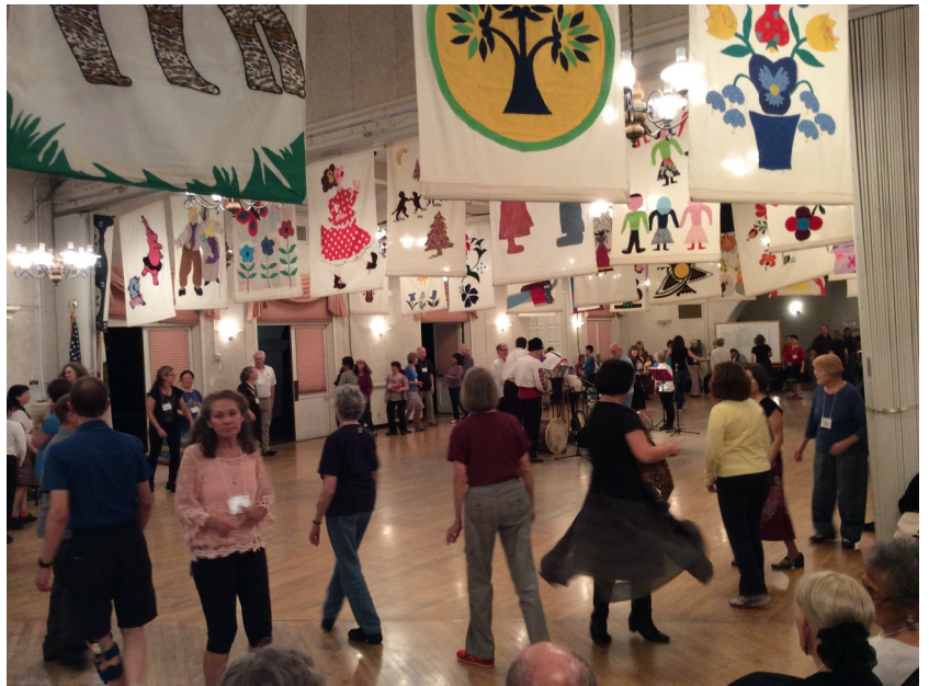
The party begins at the Friday night dance