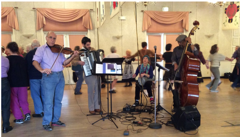
The Garlic Band play for dancing.