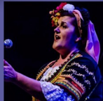
Tzvetanka Varimezova Bulgarian Singing