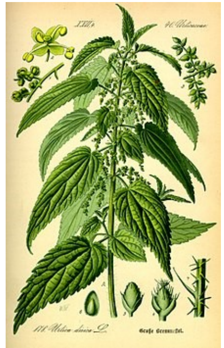
Urtica dioica , often known as common nettle