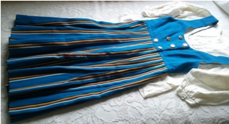
Photo 2: Woman's costume from Munsala, an area about halfway up the west coast of Finland. The woolen skirt is thick and soft, striped with beautiful colors: the wealth of the wearer was estimated by the quality of the woolen cloth worn. Like the men's vests, women's bodices usually had handsome metal buttons up the front. The bodice also is lined, in this case with white cotton, for both warmth and comfort (note that it is lying on the blouse). A white apron would have completed the outfit.

Women wore ample calf-length woolen skirts, usually striped, that were gathered onto the bottom of a sleeveless woolen bodice of a contrasting color ( Photo 2 ). A white blouse or chemise typically peeks out from underneath—usually made now of cotton or (older) linen; but in yet earlier times the favorite cloth for this was of nettle-fiber.