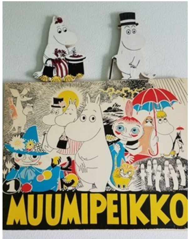
Photo 2: Meet the Muumipeikko, or Moomin-trolls—favorite Finnish cartoon creatures created by Tove Jansson. On the cover of his first book you can see many of these delightful inhabitants of the Finnish archipelago, and up on top (borrowed from the refrigerator door) are Moominpapa with his cane and tall hat, and Moominmamma busy filling a tall hat with wild lingonberries.