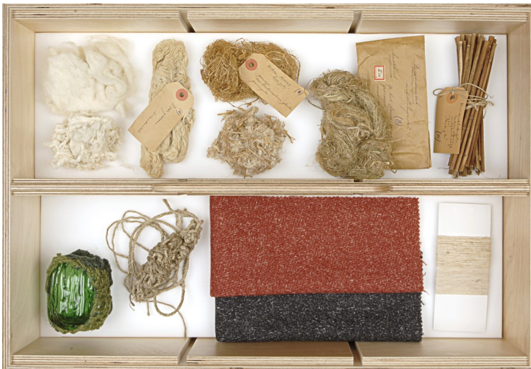
Nettle fibre, stem, yarn, textile, jewellery with glass and nettle yarn