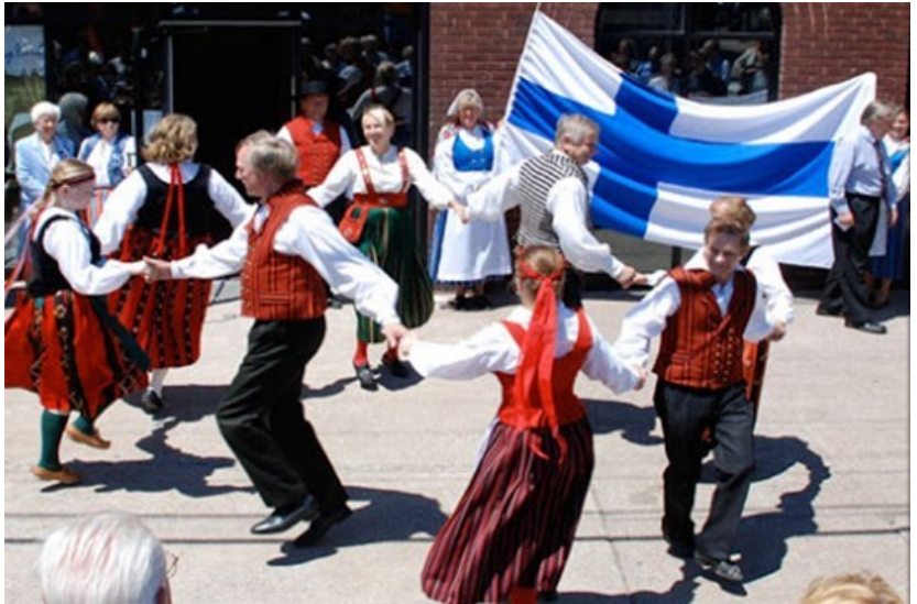
Photo 1: The popular Finnish dance group SISU performing a circle dance at the Seurasaari open-air museum in Helsinki.

Traditional folkwear in much of Finland resembles that of Sweden next door, which is not surprising since Swedish is the native language in parts of Finland. Men's clothes were cut and tailored much like Swedish ones, although the colors among Finns were different. Whereas Swedish knee-britches were most often bright yellow or light blue, Finnish pants (knee-length or long) tended toward black or dark blue ( Photo 1 ). Both groups, however, typically wore sleeveless woolen vests with shiny metal buttons over a white shirt with long, full sleeves, and over those a long-sleeved woolen jacket. Tall, fancily-knitted white socks and sturdy leather shoes completed the outfit.