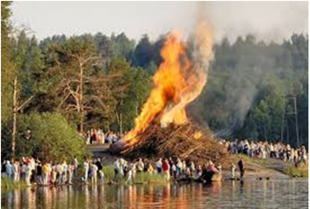
Photo 1: Midsummer bonfire at Seurasaari, Helsinki's open-air museum. Typically enormous, the festival is attended by masses of people who—if possible—circle the fire dancing, during the short night.

Around their bonfires, everyone young and old happily dance circle and chain dances, traditionally moving left in a clockwise—that is, sunwise—direction, originally to add power to the life-giving sun and its fiery counterpart before them. Some even choose to wear their local traditional costumes, this being one of the few times and places you can still see them, aside from visiting the remarkable National Museum of Finland in Helsinki.