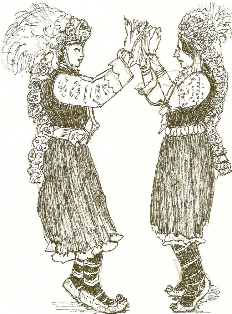
Fig. 2: Two Lazarki, the Shetalitsi, dancing a bouyenek for a village household, waving their handkerchiefs high as one might do in a ruchenitsa. They wear the heavy metal belts, necklaces, and earrings used by brides—gladly lent to them for the occasion by friends and relations in the hope they will absorb some of the youthful “fertility” energy of the girls. The headdresses are decked with massive strings of brightly colored paper flowers (made by the girls) that hang far down their backs, and topped by large bunches of feather-grass ( Stipa pennata ). (Drawn by A. Peters from an old photo.)

The girls, called Lazarki , rehearse for weeks, the older, still unmarried ones teaching the newly matured girls the songs and dances they will perform. Traditionally they grouped into bands of six or more, dividing up the village among them to make it possible for every home to be visited. Two members of each band, called Shetalitsi ( Fig. 2 ), prepare to do most of the energetic dancing, while the others will sing. The tunes are few, the words many, for they will need an appropriate ditty for every member of each household: for the master and the mistress, for married and unmarried offspring of either sex, for the beehives and lambs, barns, fields, and orchards. Finally, on Lazarus weekend, they all dress in their best traditional holiday costumes, loading themselves with bridal jewelry, fancy metal belts, antique coin necklaces, and special headdresses covered with bright paper flowers called “tulips”, and topped with long feathers, tall feather-grass, and sprigs of box-wood ( Fig. 3, 4 ). The coins and other metal trappings jingle as the girls walk and dance, so that, as the elderly village women would say, the ringing of the metal will chase away all evils. (This notion, too, can be traced back several thousand years, to when humans first isolated metal and heard its remarkable ringing sound.)