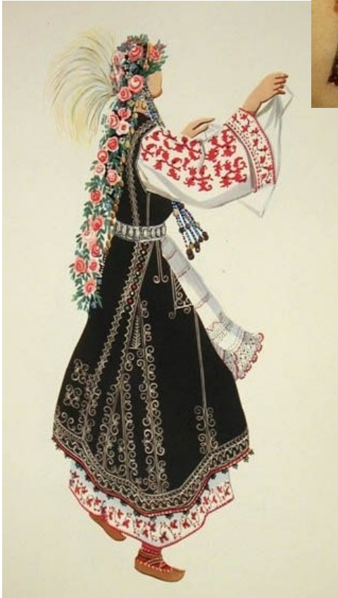
Fig. 4: Lazarka wearing the Shope costume of the Sofia area, in which the jumper (sukman) may be either black or royal blue, but always with thick white cords couched onto the surface in long lines of elegant curlicues. Note, too, her metal belt, long chains of jewelry hung beside her ears, and her tuft of feather-grass.