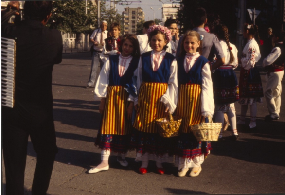
Fig. 5: Young Lazarki carrying the baskets into which householders place gifts of food, or perhaps coins, in return for the blessings for prosperity bestowed by the girls' ritual songs and dances. (April 1993;)

Dance for this young bride, This year's bride, And for next year's cradle.