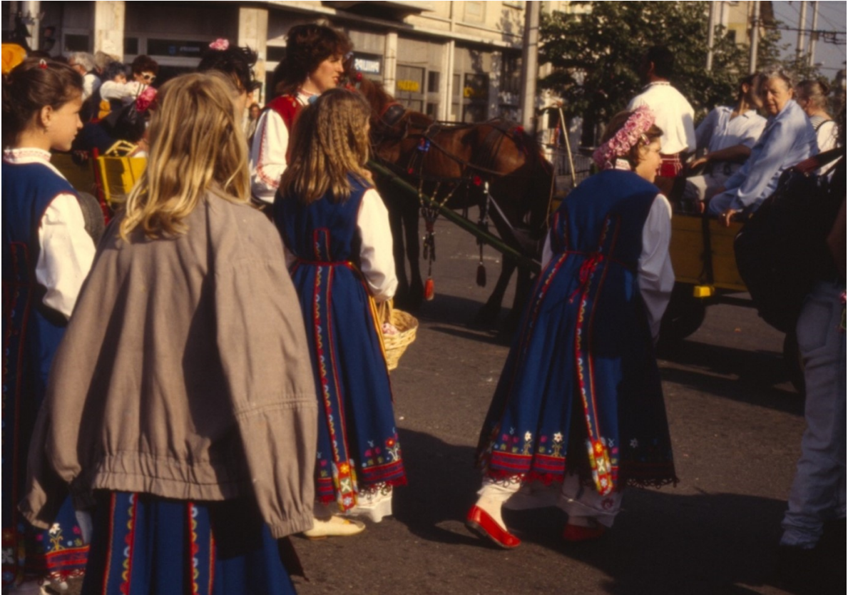
Fig. 1: Lazarki from near Sofia (western Bulgaria), congregating in April 1993 for the spring festivities. That region is famous for the beautiful blue color of the locally traditional sukman (jumper); and the sukmani of these girls' still have the ancient embroidered "vestigial sleeves" hanging down their backs (see Costume Corner, SCENE , March 2021).

Every year on Lazarus Saturday, eight days before Orthodox Easter, young Bulgarian girls put on special finery and go out into the village together to dance and sing ( Fig. 1 ). This year, Lazarus Day falls on April 24: it will be the girls' special day, their ritual "coming out" into adult society— Lazarouvanè . Now, as Spring bursts into bloom, they present themselves as eligible for marriage—a symbolism that goes back for millennia. (When Christianity was imposed 1500 years ago, the farmers hitched their crucial celebrations of the spring renewal of agrarian life to the Raising of Lazarus, since the Church considered the Raising of Christ on Easter, a week later, to be too sacred.)