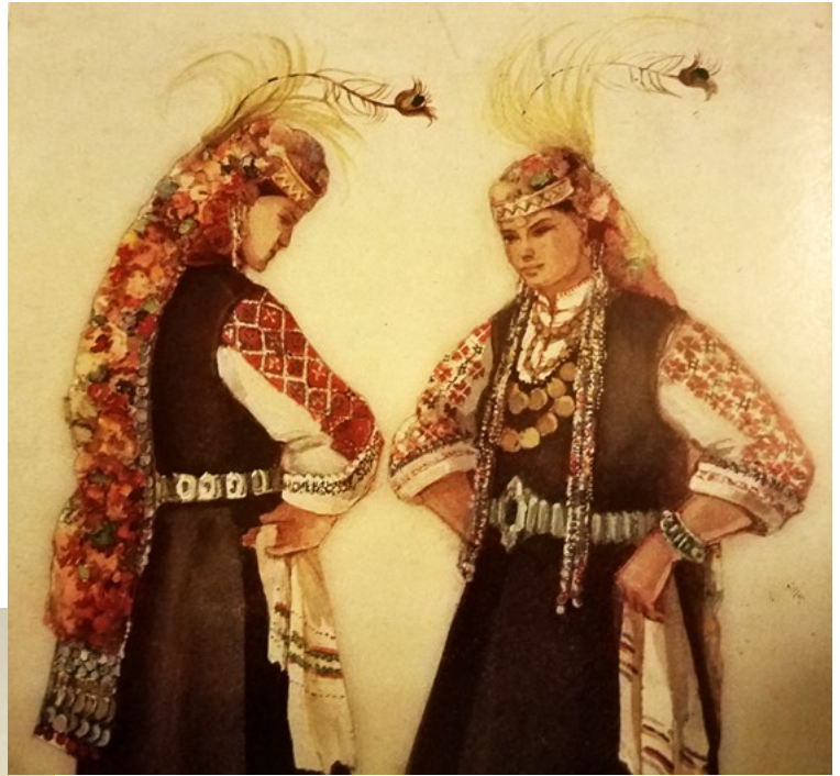
Fig. 3: Two Lazarki in full regalia: note the metal belts, coin and chain jewelry, and long feathers as well as feather-grass on the headdress. They are also each carrying the all-important white ritual towels or handkerchiefs, used both in the dances and for marking the person to whom the abundance-ritual is currently addressed. (Veleva and Lepavtsova 1974, pl. 24.)