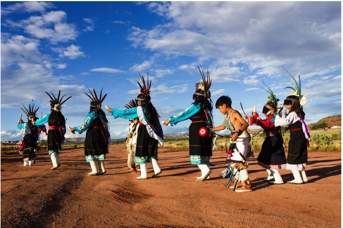
Anshe:kwe dance group processes across the desert near their Zuni Pueblo home