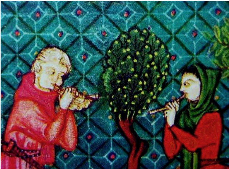
A medieval painting of Albo- ka players.