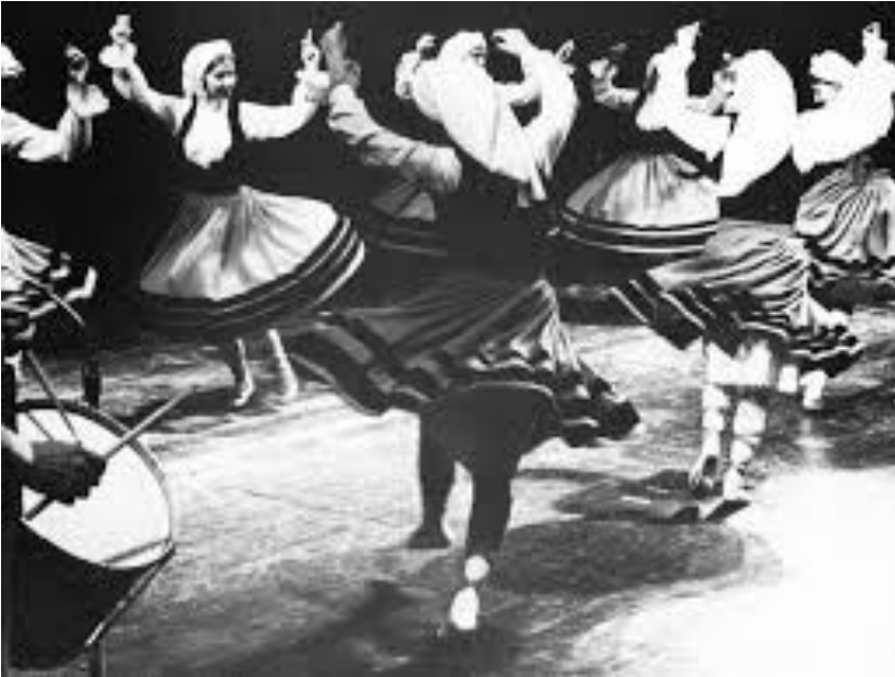
The Basque Jota, the Society of Folk Dance Historians

There is no agreed origin of the Basque Jota . Some believe that the Jota came from Southeast Spain via Aragón more than two hundred years ago. Others feel it came via Castilla, and still others feel it originated within the Basque provinces and then later on, adapted elements from neighboring regions.