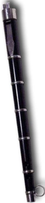
On the left, a Txistu On the right, an Alboka

In the Basque provinces, Jotas are almost exclusively danced to live music. Up until recently, Jotas were often danced to the music of Basque musical instruments. A "txistulari," a single person who plays with his left hand a "txistu" (a three-holed flute) and beats the rhythm with the right hand on a "tamboril" (a snare-type drum) suspended from the crook of the left elbow. The "triki-trixa" is an accordionist and singer/tambourine combination. Jota music also is played by an "Albokari" and a singer/tambourine combination. The "Alboka" (a double-reeded bagless bagpipe) sounds similar to and is played like the double-reed instruments of Eastern Europe – the "zurna" or "zurla."