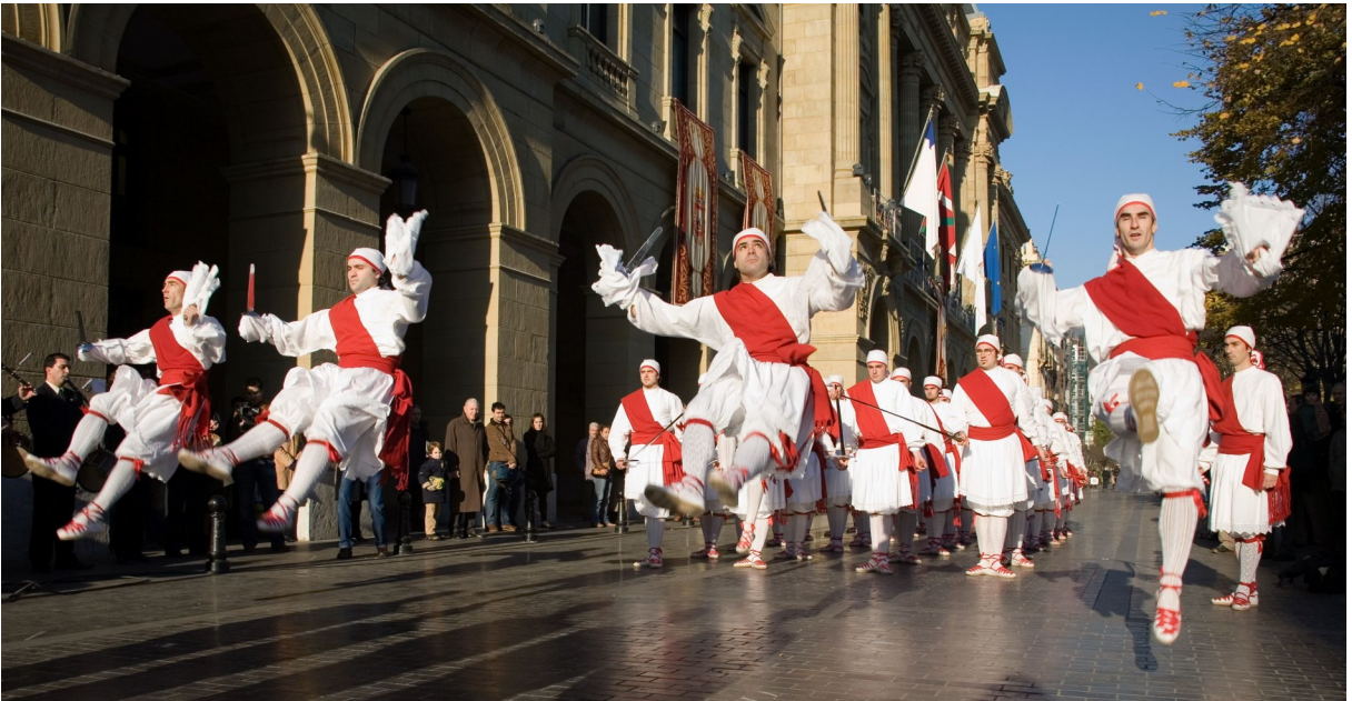
Basque Dancers. 27 December 2006

Jotas today are composed of a suite or couplet of two dances, the Fandango and Arin-Arin (pronounced "Ah-reen Yah-reen" with a trilled "R"). These dances also are known by several other names. A few of those most widely used are Baile al Suelto (loose dance) referring to the fact that there is no bodily contact amongst the dancers, Orripiko , and Porrusalda . Baile al Suelto or Jota are terms that apply to Basque dances. Baile Agarrado , attached dances or dances with some form of bodily contact, is the term used to refer to foreign dances – an example is the Waltz .