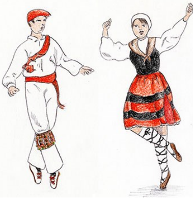
Basque Dance Smithsonian Folklife Festival

costume has a gathered skirt, shirt, apron, shawl, and head scarf. The shirt, skirt, and apron tend to be in black or navy blue, and often are of polka-dotted fabrics, with white or white polka-dotted shawls and head scarves. The "hilandera" costume has a red or green felt skirt, circular shaped, with one or more bands of black ribbon on the bottom third, a white blouse, black apron and bodice, and a white head scarf.