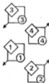
Fig. 2 bar 25