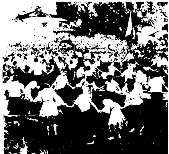
Folk Dancing in Israel