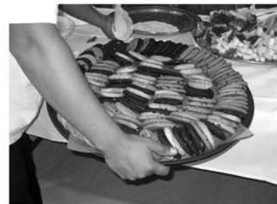
Camp Hess Kramer