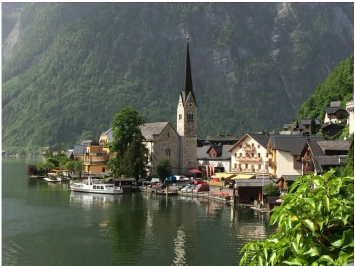
Photo 4 : The exquisite modern village of Hallstatt, showing the very narrow town sandwiched between the steep saltmountain and a deep lake. (The form hall- was early Celtic for "salt", still seen in Welsh halen "salt". The names of many old central European salt sites begin with hal-, like Halle and Halych.)

my kilt, I made the trimmed strip into a long scarf, and that is what I proudly pin across my long white dress for Scottish dancing.