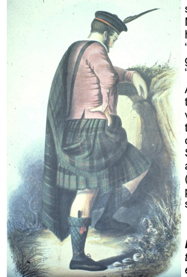
Photo 2 : Antique drawing of a man of Clan Gunn, in a predominantly green tartan that blends with the local foliage. Note that the cape is simply one end of the cloth forming the wrap-around skirt.

As they fanned out across western Europe around 400 BCE, the Celts took their plaids with them. Until relatively recently, the man's garment was a vast length of plaid wool twill long enough that he could roll up in it three times for a warm night's sleep under a bush (something his British enemies couldn't do, in their fitted uniforms, which lost them some battles). When our Scots warrior awoke, he would hand-pleat half of its length around his waist and belt it on, flinging the other half over his shoulder to serve as a cape ( Photo 2 ). The cloth for today's kilt is but half its former length, the cape portion having been discarded, and the remaining half having been neatly sewn into pleats so the man doesn't have to recreate his skirt every time he