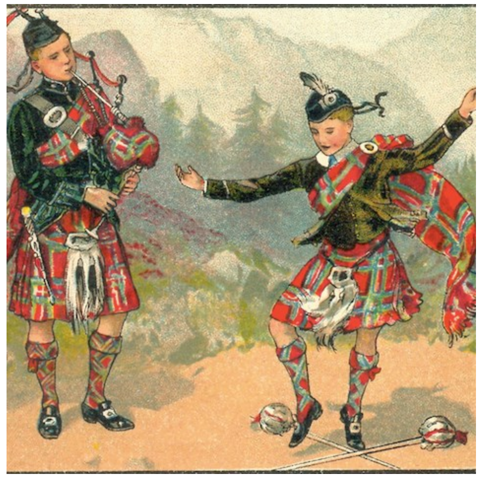
Published by the Folkdance Federation of California, South