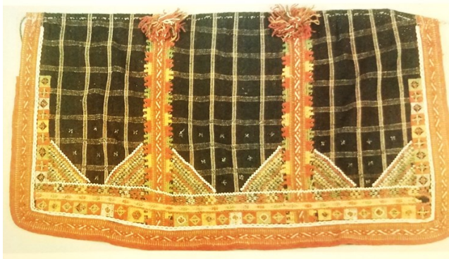
Photo 4: Square-patterned panyóva with token tufts of string at the waist; ca. 1900, from Oryol province, central Russia.

Moving yet farther north to yet colder climes, we see that now even a skirt isn’t warm enough. Sometimes the apron gets raised to the neck, then the skirt gets lengthened and pulled up to under the armpits, where it has to be supported by shoulder straps ( Photo 1 ). Presto: the sarafán , a floor-length jumper. By this time, however, we are so far north (and into even more heavily Finnic territory) that the material of the skirt no longer has the squared patterns, being plain dark-colored or