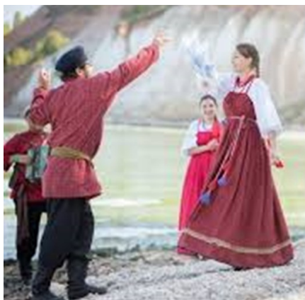
Photo 1: Typical men's and women's north Russian costumes, now taken as the Russian national folk costume.

We tend to think of Russian costumes as consisting of a long, A-line red jumper ( sarafan ) over an embroidered blouse for women, and for men a high-collared, bright-colored (or embroidered) shirt and red sash over baggy pants—with black shoes for women and boots for men ( Photo 1 ). Well, sort of... but that's only the tip of the iceberg. It helps to see the historical development to understand the variety and its distribution among the East Slavs in general.