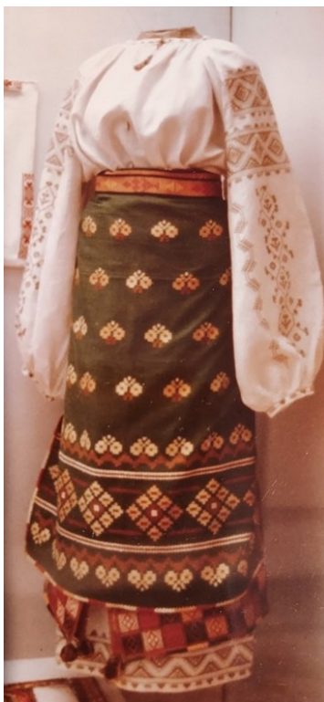
Photo 3: An old-style ankle-length Ukrainian costume, with tunic and overskirt much as in Photo 2, but a much larger apron, and fringes now appearing in token as string pompoms at the bottom of the square-patterned overskirt ( panyóva ). (50-year-ago display in Ethnographic Museum, Leningrad.)