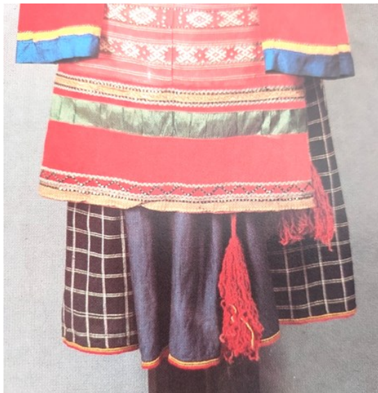
Photo 5: Square-patterned panyóva closed with a plain black panel into a warmer skirt; ca. 1900, from Tambov province, central Russia.