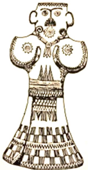
Photo 2: Prehistoric statuette from Kličevac, Serbia, at 1600 BCE already showing major traits of Balkan and East Slavic women's traditional dress: tunic with large embroidered sleeves, sash, apron with long fringes, square-patterned overskirt.

Stone Age European women of 20,000 BCE, however, sometimes wore a narrow belt-band from which long strings hung down (imagine a skimpy hula skirt). By 5000 BCE, they might wear a tight wrap-around skirt with a checkerboard pattern—they knew by then how to weave cloth—and sometimes even a tight-fitting, short-sleeved jacket. Remarkably, the checked skirt and the related string skirt still survive in costumes all over East