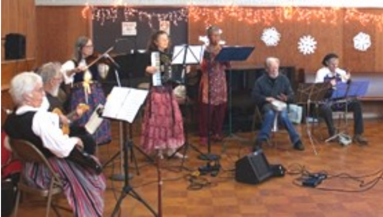
The Fifth Friday band provided live music for both New Year's Eve and Winter Festival

Pasadena Folk Dance Co-op celebrated their two traditional yearly events this winter. New Year's Eve was a fun festive evening including an all-request dance program plus live music by Fifth Friday. The decorations were sparkling and the potluck refreshments yummy.