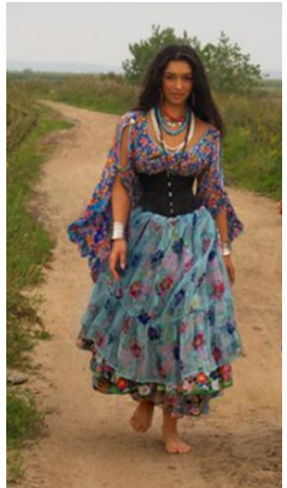
Photo 1: Romani woman wearing boat-necked blouse, tightly laced bodice, and multiple long skirts, one over the other. Note that this allows her, in dancing, to swish the top skirts all she likes while the under-skirts (and often trousers) continue to hide her legs.

So why did this music rub off in the eastern Balkans, but less so or not at all farther north? As a folklorist, I have had the distinct impression that the Bulgarian R'chenitsa is treated there as the oldest and most august of dances, having been used, for example, as the dance with which to surround the bride to keep evil spirits away from her as she was finally escorted from her family's house to that of her new husband: this is another 7/8 rhythm, counted the opposite way from the Syrtos , namely, short-short-long (2-2-3). One day, reading Greek, I noticed that Aristophanes, the ancient Greek writer of comedies, has his chorus in one play come stomping in saying, "I can't wait to get this heavy cloak off and start dancing to the anapests!" But anapest rhythm is short-short-long : proof positive that this rhythm was both used, and danced to , 2500 years ago in the Balkans. So apparently the fancy rhythms of the Dom rubbed off onto, and stayed with, precisely the people who already knew and used at least some of them. ("Wow, did you hear that? 11 beats! You can even combine two patterns in the same phrase!"—as in Elerinka and Devojče Devojče still today.)