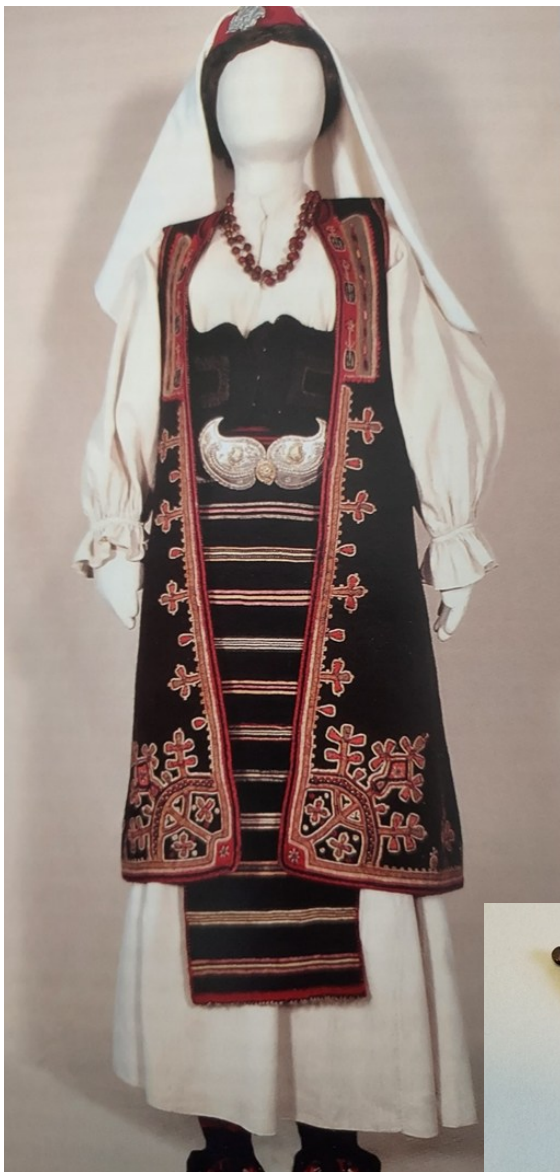
Photo 2, above: Woman's costume with eye-shaped belt buckle, from Stari Brach, Serbia.

Years later, when I was starting to amass books on European folk costume, I started to notice eye-shaped belt-fasteners on women from the Balkans ( Photo 2 ). Their placement as belt buckles made sense to me, for on the back of mine I could see little holes, three on each side, for sewing the silver "eyes" onto separate pieces of cloth, which could then be closed together with the central hook ( Photo 3 ). As I collected images and information, I never found pictures of any with dangling chains that matched mine. But I was amazed to see how enormous, even bulbous, the eye-shaped plates sometimes became ( Photo 4 ). And once I was even told that, at times of persecution by their Turkish overlords, the local Balkan women made their buckles really huge so that their oppressors couldn't tell which of them was pregnant, thereby keeping their babies safer.