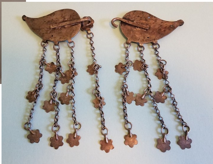
Photo 3, below: Back side of my silver clasp, showing the simple hooking device as well as tiny holes, spaced in a triangle, for attachment.

Years later, when I was starting to amass books on European folk costume, I started to notice eye-shaped belt-fasteners on women from the Balkans ( Photo 2 ). Their placement as belt buckles made sense to me, for on the back of mine I could see little holes, three on each side, for sewing the silver "eyes" onto separate pieces of cloth, which could then be closed together with the central hook ( Photo 3 ). As I collected images and information, I never found pictures of any with dangling chains that matched mine. But I was amazed to see how enormous, even bulbous, the eye-shaped plates sometimes became ( Photo 4 ). And once I was even told that, at times of persecution by their Turkish overlords, the local Balkan women made their buckles really huge so that their oppressors couldn't tell which of them was pregnant, thereby keeping their babies safer.