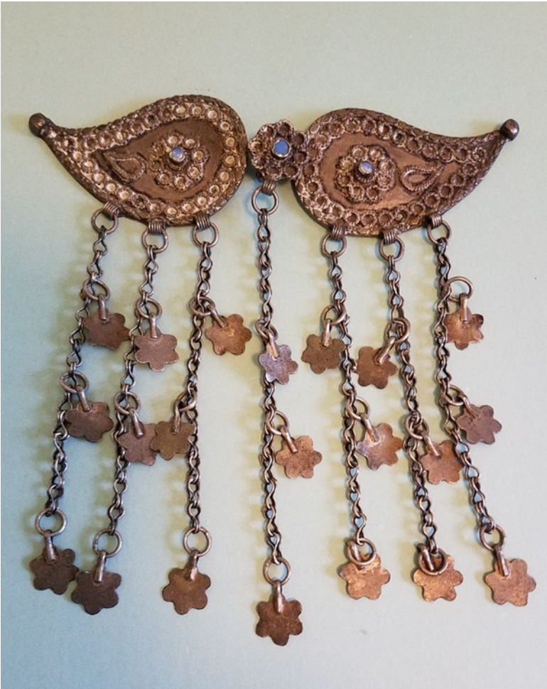
Photo 1: Eye-shaped silver clasp or buckle, with dangling chains bearing three little 6-lobed platelets each. Above, the main sections have been decorated with silver filigree, and 3 little blue stones have been set in as well.

Long ago in London, just months after Queen Elizabeth II was crowned, my parents took us kids along to the rambling underground Silver Vaults. There, after much wandering and looking, I finally spent 17 schillings—most of my pocket money—on an antique silver clasp or fastener ( Photo 1 ). The vendor knew nothing about it or its origin, but the eye-shaped pieces with their little blue stones and fancy dangling chains fascinated me. “Perfect for dancing!” I thought. I had already been involved in folk-dancing for several years, and I saw a lot more of it during that seminal year in Europe. But nowhere did I see anything like my silver piece.