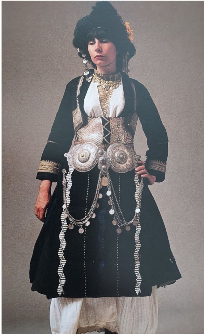
Photo 4: Young woman's costume with huge belt-bosses and chains with coins, from Imathia (Roumlouki), northern Greece.